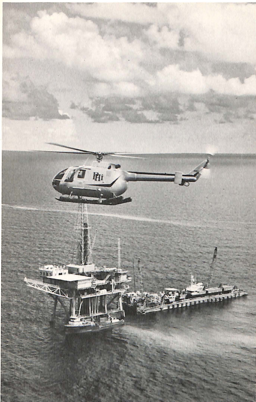
A Boeing Vertol BO-105C twin jet helicopter, operated by Petroleum Helicopters, Inc., is shown serving one of the more than 2,000 off-shore oil rigs in the Gulf of Mexico.