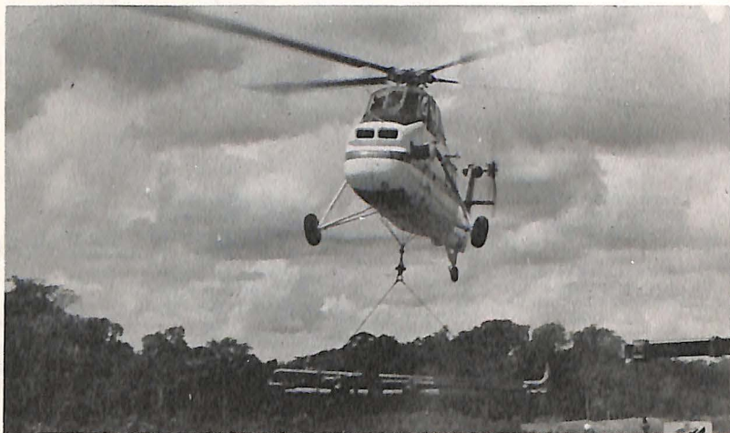
The Sikorsky S-58T -- a corporate transport or heavy lift workhorse -- shown here at work in a drill rig installation.