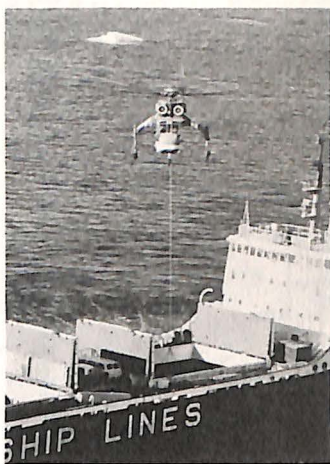
A mile offshore a Sikorsky Skycrane hovers 65 feet above freighter's hatch preparing to lift gondola for delivery to village ashore.