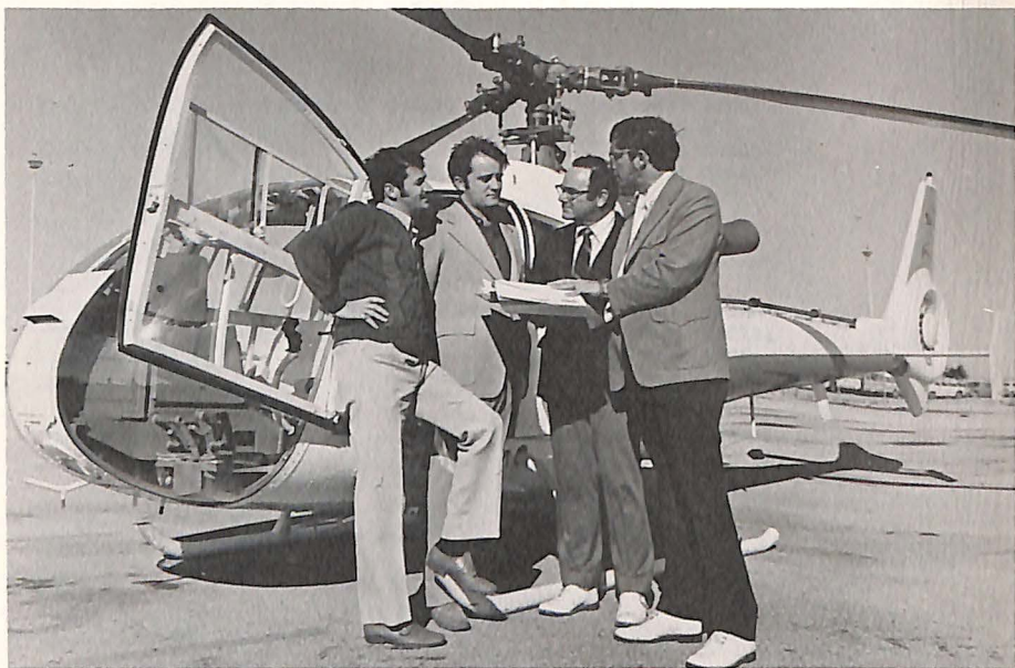
Today more than 550 industries operate helicopters as modern executive transports. The helicopter shown here is a Vought five-place Gazelle with the shrouded tail rotor.