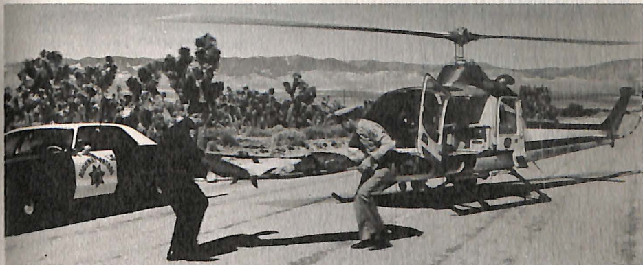
Today in many states, rescue ambulance helicopters patrol the highways to transport accident victims to the hospital -- when minutes really count. Here a California Highway Patrol Fairchild Industries FH-1100 ambulance helicopter is on the scene.