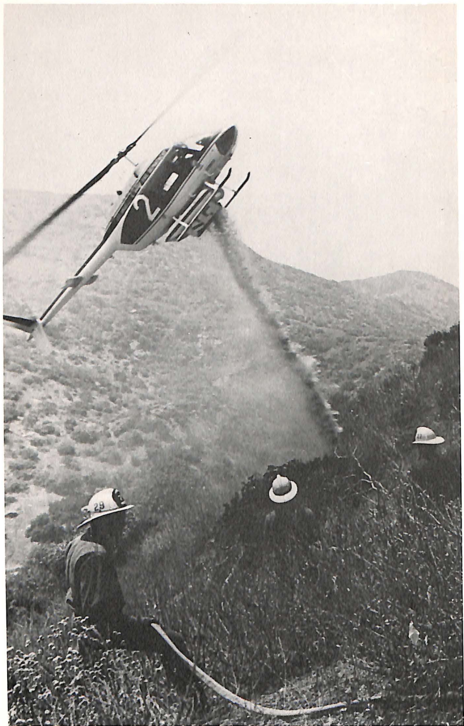
A Los Angeles City Fire Department Bell JetRanger drops fire suppressant chemicals onto blaze during a series of brush fires in the city.