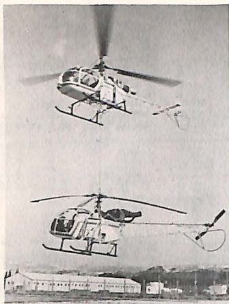
The helping hand helicopter -- one Vought Lama five-place helicopter transfers another.