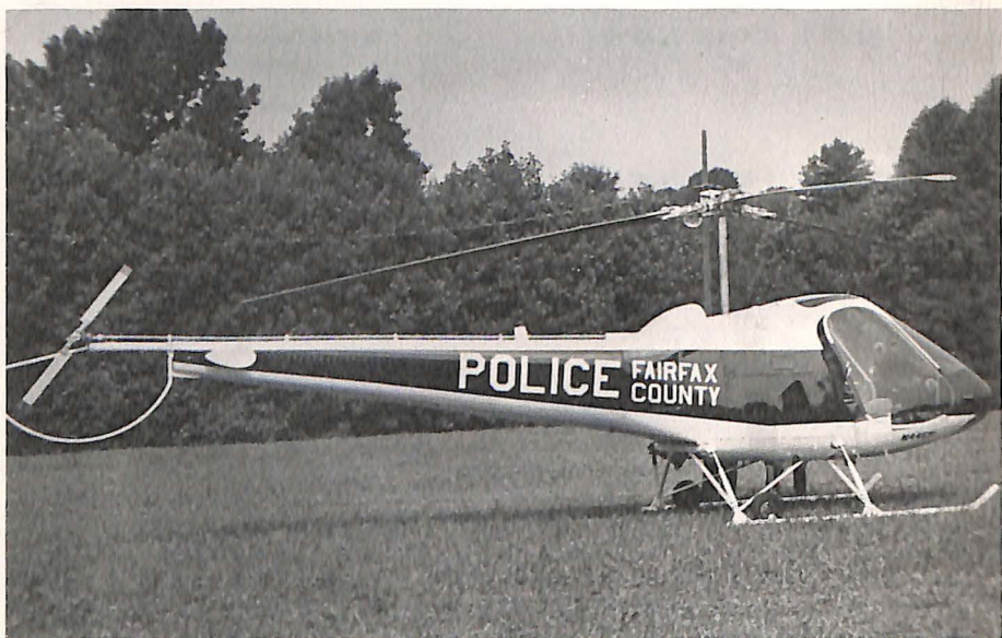
In Virginia, the Fairfax County police find their Enstrom F-28 helicopter especially useful in apprehending house burglars and escaped criminals.