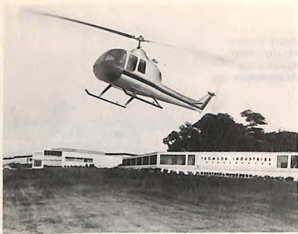
Thomson Industries, Inc.'s helicopter takes-off from the Long Island plant.