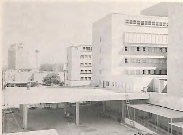
Nearing completion— the rooftop heliport at Baptist Memorial Hospital, San Antonio, Texas.