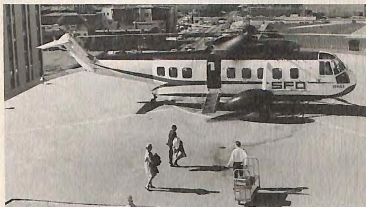
Passengers board a SF&O Helicopter airlines at Oakland, Cal., downtown garage rooftop heliport.