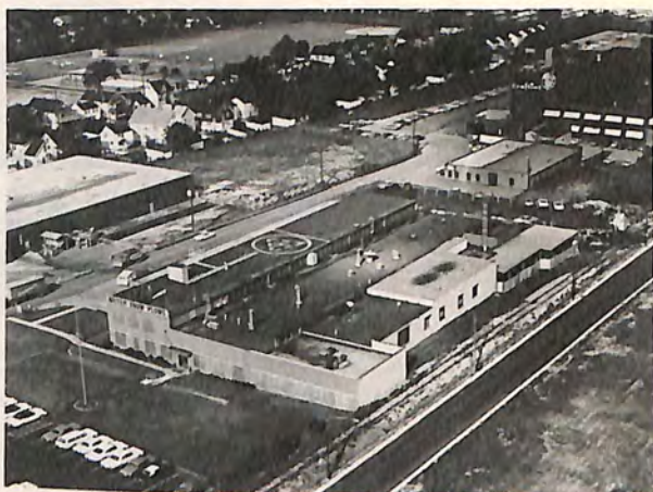
In Cleveland, Ohio Meyer Snow Plows Company's helicopter Sno-Bird II provides fast transportation between plants and area airports.