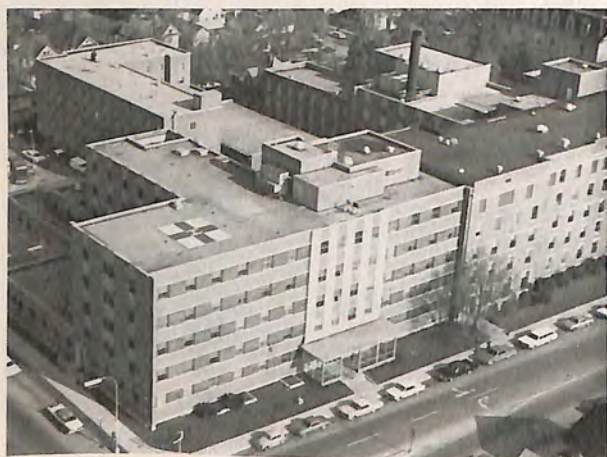
With an available exit-rooftops can become heliports-St. Mary's Hospital heliport-Kankakee, Illinois.