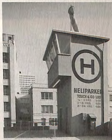
Another First -- Seattle, Washington's downtown rooftop HELIPARKER Garage.