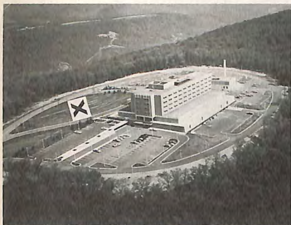
Cumberland, Maryland's Sacred Heart Hospital heliport serves accident cases from the surrounding Blue Ridge Mountain area.