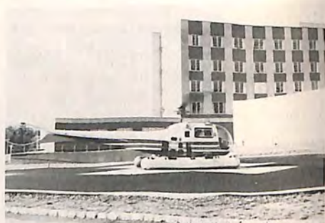
A helicopter brings a burn victim to the St. Barnabas Medical Center's Hyperbaric Chamber, Livingston, N. J.—one of the 12 hospital burn centers in the country.