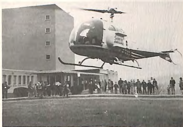
Michigan's Superior Ambulance Service, Inc. is the first land ambulance company to operate a helicopter. Equipped to handle cardiac arrest emergencies and coronary care transfers, the helicopter can replace four ground ambulances.