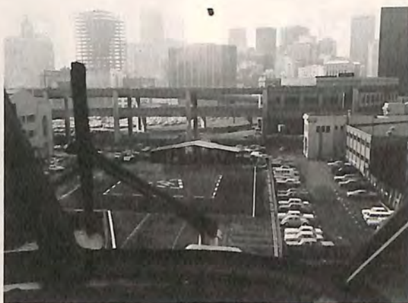
San Francisco, Cal. — new downtown city heliport at Ferry Building.