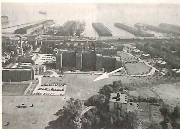
U.S. Public Health Service Hospital heliport-Staten Island, New York.