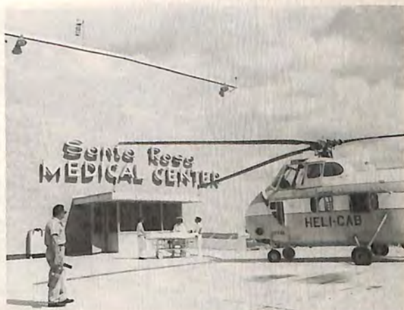
Patient arrives by Helicab on Santa Rosa's rooftop heliport-San Antonio, Texas.