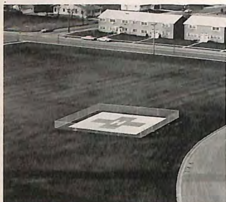
In a Joliet, Illinois residential, this 50' by 50' heliport is located near the emergency entrance at St. Joseph Hospital.