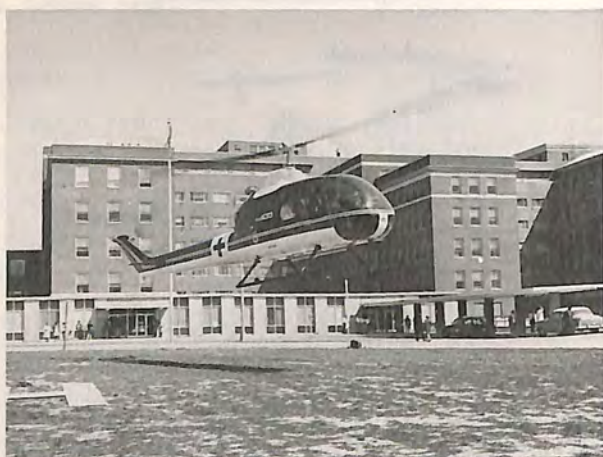
An ambulance helicopter lands at DC General Hospital-one of two civilian hospital heliports in the Nation's Capital-the other heliport is at the Washington Hospital Center.