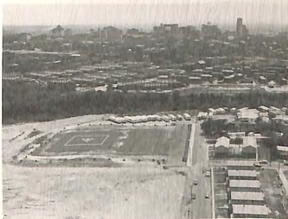
Richmond, Va. new Municipal heliport.