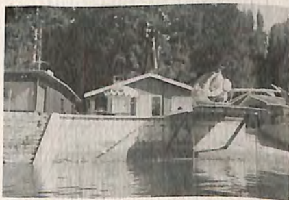
A lakeside private heliport and the family's helicopter makes fast transportation readily available.