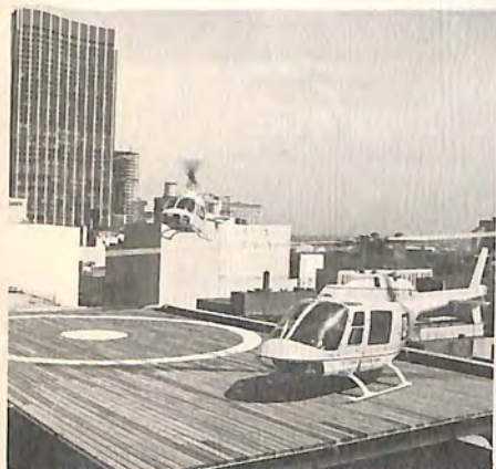
Citizen and Southern Bank helicopters land at one of the 40 banks served in the Atlanta, Georgia area.