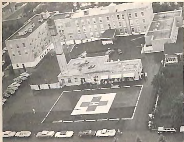
Kalispell General Hospital Heliport-the first designated, designed and approved by the Montana Aeronautics Commission under the Montana Hospital Heliport Program.