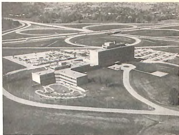
The modern Missouri Baptist Hospital heliport-St. Louis, Missouri.