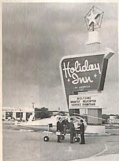
A Motel heliport, Wichita, Kansas