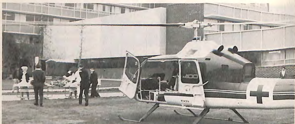
In an emergency, the hospital lawn becomes an "instant" heliport.