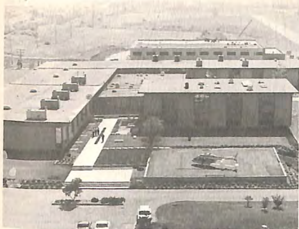
The Holly-Matic Corporation's helicopter is ready for take-off