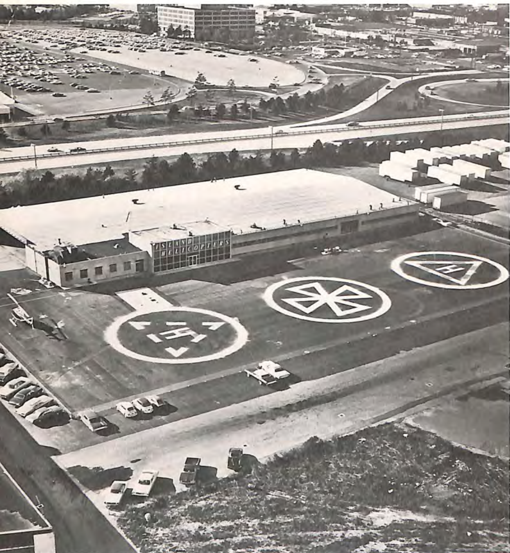
Island Helicopters operate "Metrobus" scheduled morning/evening commuter service on weekdays between their Long Island heliport and New York's Wall Street and 34th Street East heliports.