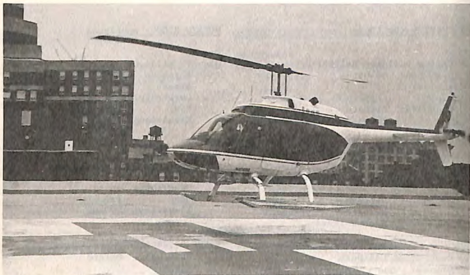
A Maryland State Highway Police ambulance helicopter lands at the University of Maryland Hospital Heliport. Because of these police ambulance helicopters, everyone in the State is less than an hour from highly specialized medical care at the Hospital's Trauma Center.