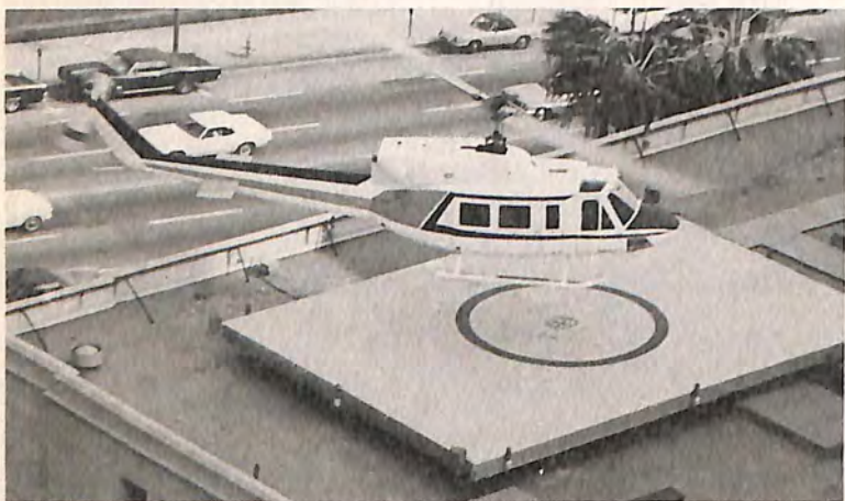
A Bell Twin-Two-Twelve -- a 15-place helicopter -- lands on the convenient City Hall rooftop heliport in downtown Los Angeles.