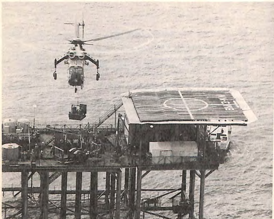
This is a typical off-shore oil rig heliport. There are more than 2,000 of these landing facilities in the Gulf of Mexico and more in other coastal areas. A Sikorsky Skycrane lowers a 52-ton engine assembly onto the drilling platform.