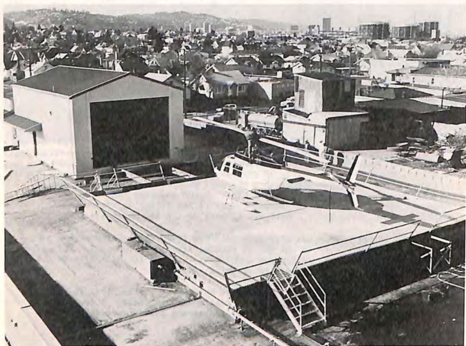
The Portland (Oregon) General Electric's Bell JetRanger is ready for takeoff from the company's rooftop heliport.