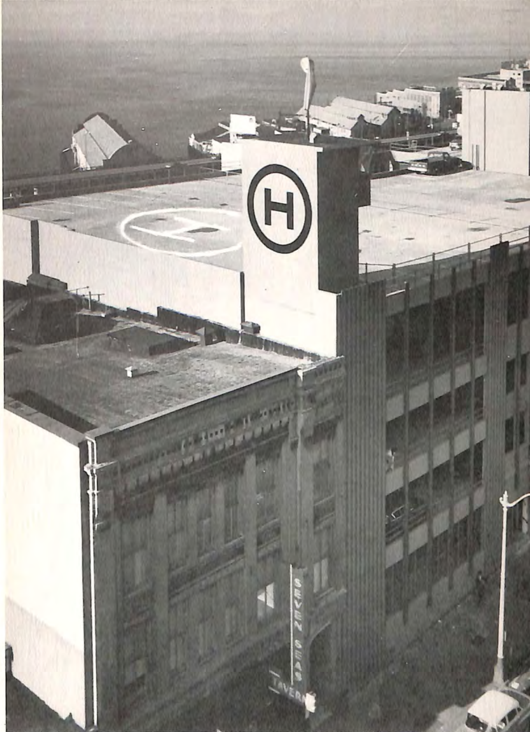
In Seattle, Washington, the downtown HELIPARKER Garage has its own control tower and windsock.