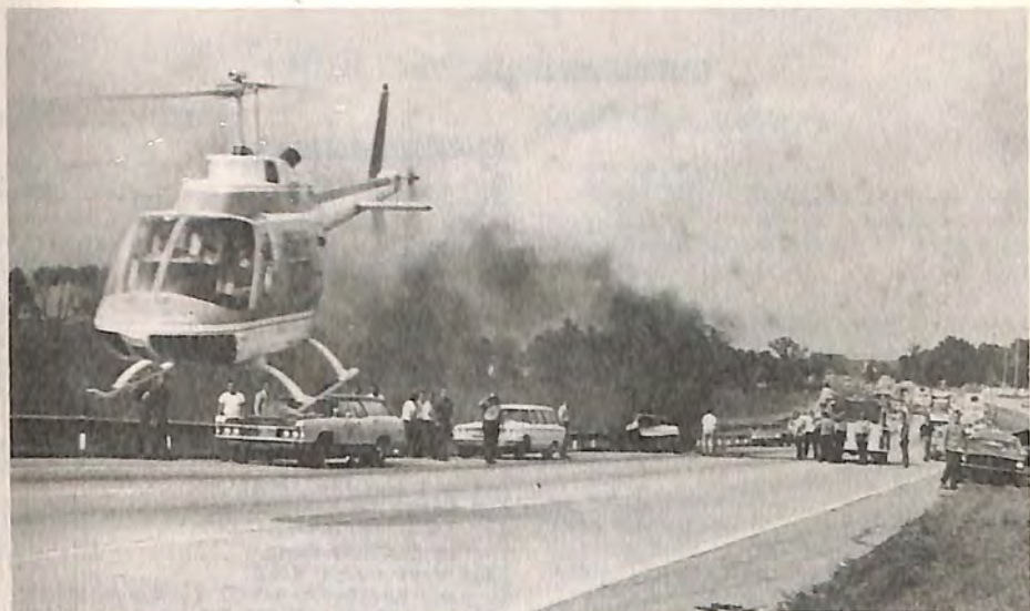
When minutes really count, the highway is an "instant" heliport for the life-saving ambulance helicopter.