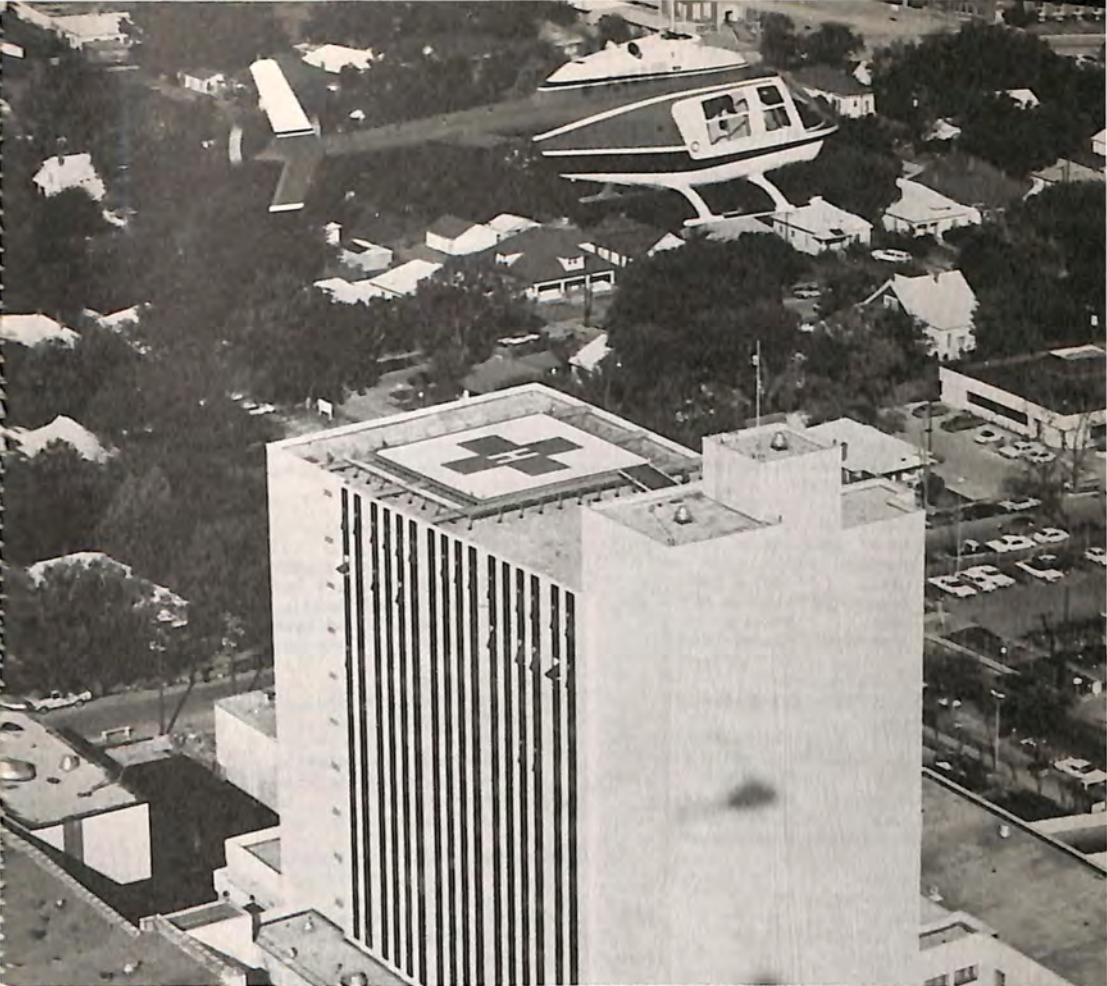
In downtown Fort Worth, Texas -- the modern John Peter Smith Hospital's rooftop heliport. The go anywhere -- land anywhere helicopter -- shown here on the deck heliport of the Icebreaker "Eastwind".