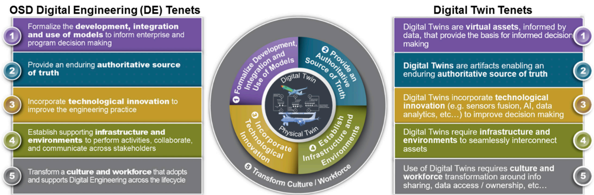
Figure 2. Digital Twin Alignment with the Office of the Secretary of Defense Digital Engineering Strategy [5].

Alignment between the DoD Digital Engineering Strategy and industry’s viewpoint of the Digital Twin relies on purposeful and collaborative efforts between people. This requires a partnership between DoD and industry where both parties achieve their values. To enable this relationship, the organizations supporting this position paper are the industry voice and continue to work collaboratively with DoD. This partnership takes many different relationships: some direct (DoD and a specific organization), some collaborative (DoD and a working group) and some indirect (DoD and professional societies).